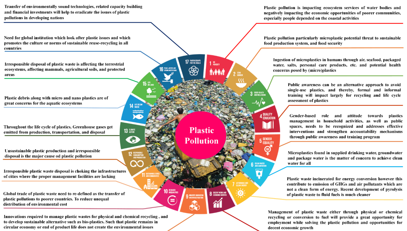
Figure 2. Perspectives on interlinkages and relationships between plastics pollution, management, and each SDG.

After the millennium development goals, the United Nations launched the sustainable development goals (SDGs) in September 2015, which have been widely implemented by various nations to achieve sustainability [195]. The objectives of the SDGs are to take the collective decision against the most critical multi-dimensional socio-economic-environmental global threats. There are 17 SDGs and 169 targets; out of them, only one goal is directly related to plastic pollution, i.e., SDG 14: Life Below Water with its target 14.1.b, as an indicator, focuses on reducing marine (micro)plastic debris loads particularly from the land activities by 2025 [196]. SDG indicators depict challenges for each country at national, sub-national, or supra-national levels to pursue the nature and behavior of plastics in the environment, including MPs pollution monitoring and management [196,197]. Therefore, the interlinkages between plastics pollution and waste management with each of the SDGs are discussed in the following subsections and are highlighted in Figure 2.